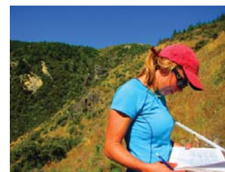
Collecting data on fuel loads in sites invaded by the introduced lodgepole pine.