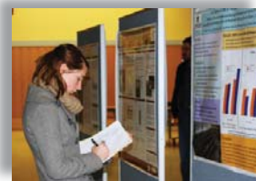
Above: A student takes notes on a presentation poster.