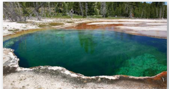
Hot springs, Yellowstone National Park

Sustainable Bioproducts is funded by a NSF Small Business Innovation and Research grant to investigate the feasibility of using this organism for biofuels production.