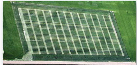
Wheat test plots at different N fertilizer rates following pea and lentil green manures, Amsterdam, MT, 2011.