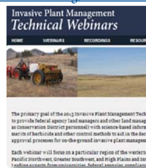
Partial screen shot of the CISM Technical Webinar Series.

So successful and well received were these webinars that plans are already in the works for subsequent webinars in 2014 in both the eastern and western U.S. Recordings of the webinar presentations and technical reading materials are available on the webinar series website: www.weedcenter.org/technicalwebinars .