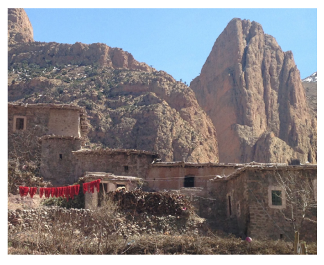
Wool drying after dying in the village of Taghia Morocco.