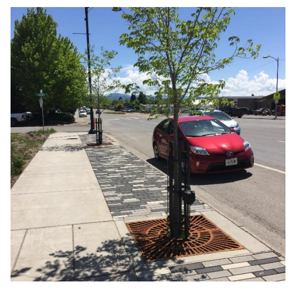
Figure 3: Completed phase 1 permeable paver system.

regulations and meet "U.S. EPA stormwater performance criteria as a structural best management practice (BMP) while providing parking, road, and pedestrian surfaces" (Residential, 2012).