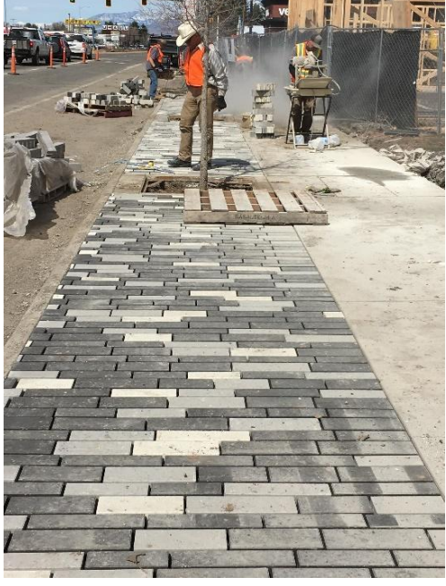
Figure 2: Permeable paver installation along N 7th Avenue, Bozeman MT.

One of the most attractive features of these systems is their land use efficiency and the ability to accomplish "storm water management in areas with different primary purposes" ("Montana Post-Construction", 2017) like parking lots. As a result, previous areas that may have been set aside for detention ponds, storm sewers, or other stormwater systems- including wooded areas and green space- could be preserved, utilized for something else, or retrofitted for increased recreation opportunities. Additionally, twenty-seven LEED (Leadership in Energy and Environmental Design) points are available with the use of PICP providing a further incentive for developers to implement them. When the sub-soil is unfrozen, ice build-up is virtually eliminated on these surfaces resulting in a reduced need to spread salt or sand. This can further decrease the sediment or chemicals that are entering the watershed. If light colored aggregate is chosen, the urban heat island effect can be reduced through evaporation and light, colored aggregates. This technology is also suitable for retrofitting current systems as demonstrated by the City's Midtown Urban Renewal District and Economic Development Division's success in 2018 in improving North 7<sup>th</sup> Avenue in Bozeman, MT (Fig 2 and 3) ("Stormwater Division | City Of Bozeman", 2018). Along with being ADA compliant, PICP systems comply with U.S. National Pollutant Discharge Elimination System (NPDES)